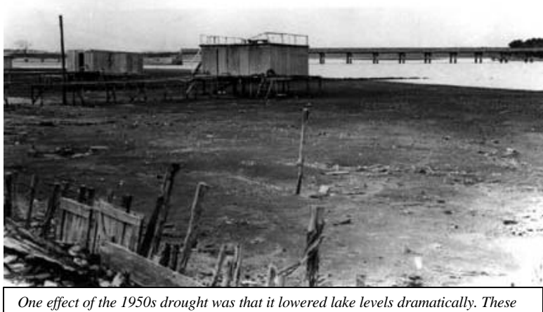
One effect of the 1950s drought was that it lowered lake levels dramatically. These two photos from the Waco area show lakefront homes that would normally be on the waterfront now rising above nothing but dirt, and a pier that extends out above a pile of mud.

The 1953 summer was blistering -- Dallas endured 52 days in excess of 100deg. F while Corsicana topped the century mark 82 times. The heat wave followed five years of below normal rains. Half the state received rains that were 30 inches less than normal amounts. Lake Dallas stood at only 11% of capacity. In 1954, yearly statewide rainfall averaged 18 inches, the least since