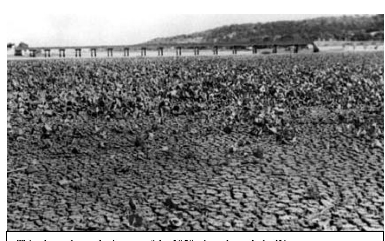
This photo shows the impact of the 1950s drought on Lake Waco.

Most weather events strike forcefully and dramatically. Images come to mind of tornadoes tossing houses in the air, sending Dorothy and Toto to run for cover. Violent hurricanes, like the storm that wrought havoc on Galveston Island in the early 1900s, sweep floodwaters across low-lying coastal areas Droughts are a much different type of phenomenon for many reasons. First, droughts are poorly