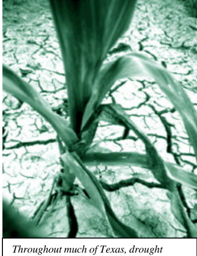
Conditions are cracking soils and ruining crops like this one.

The Palmer Drought Severity Index (PDSI) is a tool based on rainfall, evaporation and soil moisture that is widely used to gauge the severity of droughts. According the PDSI, the High Plains, Rolling Plains, the Edwards Plateau, and East, North Central, and South Central Texas are all in an extreme drought this Summer. This index predicts it is very likely that the drought will continue in North Central, East, and South Central Texas this Summer. Water levels in Falcon and Amistad reservoirs have dipped to 29% of capacity. Statewide, Texas' major reservoirs contain roughly 24 million AF, compared to more than 32 million AF in 1993. In every region of Texas, rainfall levels are only 20% of normal. Rainfall is especially low in South Texas, along the Edwards Plateau, and in the Lower Rio Grande Valley. Nearly 280 public water systems are limiting water use to avoid shortages, while seven