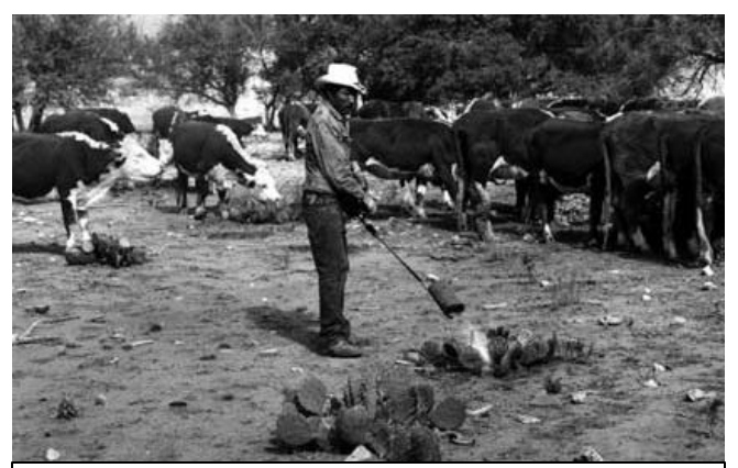
The drought of the 1950s became so bad that many West Texas ranchers ran out of grassland to graze their cattle on, and hay prices soared. As a result, some ranchers resorted to burning catcus, removing the spines, and using it for cattle feed. The photo at right shows a farmer pitching cactus out of a truck and tossing it to hungry cattle.

For many Americans, the 1950s are remembered fondly. In Texas it was a different story. Texans endured a 7-year uninterrupted drought (1950-56), which some say was the worst in 700 years. Experts believe this drought began in the Lower Rio Grande Valley and West Texas in 1949. From 1949-51, Texas rainfall dropped by 40% and West Texas experienced severe declines. By 1952, more than half the state received 20 to 30 inches less rainfall than normal. In 1952, Texas' monthly rainfall average fell to just 0.03 inches -- the lowest level since