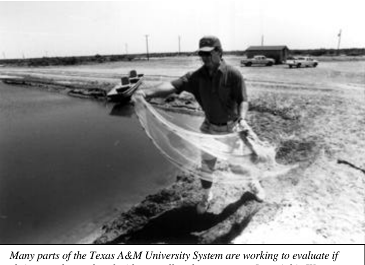
Many parts of the Texas A&M University System are working to evaluate if shrimp can be produced with naturally salty water near Imperial in West Texas. In this photo, a worker at the TAMU Aquaculture Farm is casting a net to harvest.

developing water reuse techniques. Results from laboratory studies suggest that redfish and shrimp may grow as well in West Texas groundwater as they did in natural coastal waters.