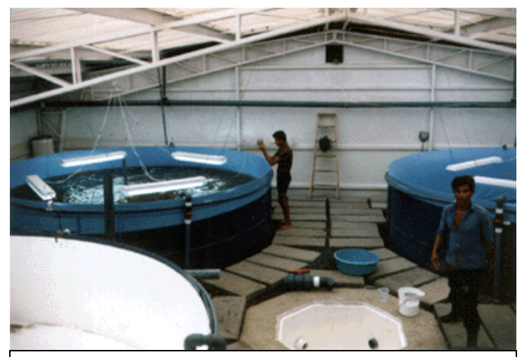
Researchers with the Texas Agricultural Experiment Station Shrimp Mariculture Facility in Corpus Christi are experimenting with a variety issues that will improve aquaculture production for shrimp and redfish. This photo shows how the inside of the facility looks, while the close-up shows some of the large shrimp that are being produced.

One of the major problems that's limited the success of Texas aquaculture has been that redfish and tilapia have a hard time surviving cold winter weather. The problem is especially troubling because nearly all Texas' operations are outdoors and many aquacultural enterprises need year-round production and profits to survive. Studies at the University of Houston and at Texas A&M University are investigating techniques to help redfish survive these crucial periods. At the University of Houston