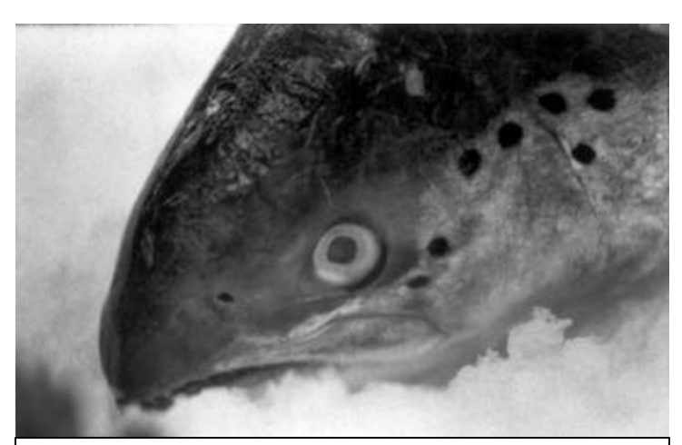
Texas producers that many more of the fish that are sold in grocery stores in the State will be raised in Texas. Although Texas has the potential for growing huge numbers of fish and shellfish, it ranks behind other states like Mississippi and Arkansa s in the amount of catfish and shrimp that are produced.

Part of the enthusiasm is fed by the increasing amount of seafood that Americans eat. Encouraged by the health and nutritional benefits. consumers have been adding fish to their diets over the past 20 years. Annual per capita consumption rose from 12 pounds in 1970 to 16 pounds in 1990 and should grow to 19 pounds by the year 2000. Ironically, much of the demand for seafood is in Texas, yet almost all of the aquacultural products