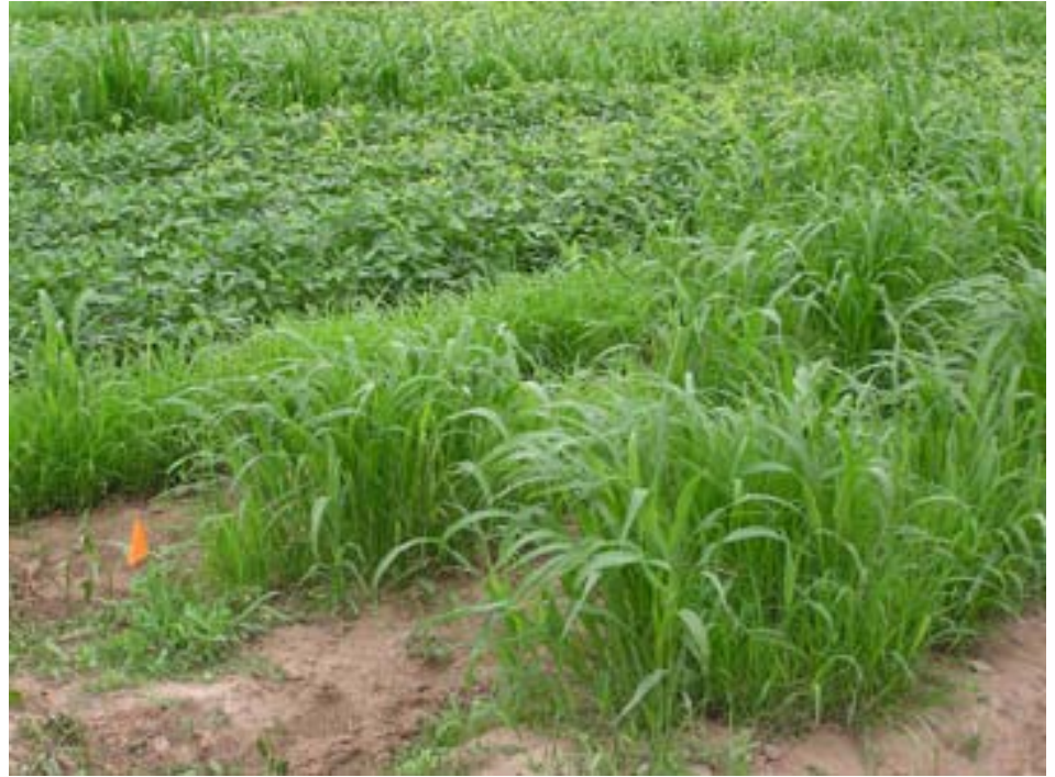
Lablab beans, cow peas and sudex were chosen as cover crops to evaluate the soil moisture and conservation benefits.

The study is evaluating the soil moisture conservation benefits of three different cover crops planted in late summer and early autumn. The cover crops that were chosen are lablab beans, cow peas and sudex. Currently, the crops are monitored for the amount of water they are using. Once they