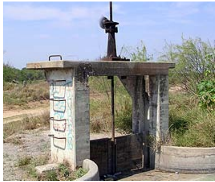
This very old head gate will be equipped with SCADA equipment and will be controlled from the Delta Lake Irrigation District Office.

This project is made possible with funding from the Rio Grande Basin Initiative, administered through Texas Water Resources Institute.